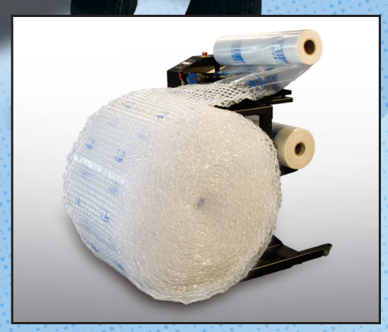
Roll Winder accessory sold separately.