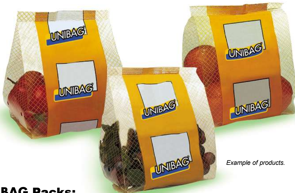
Example of products.