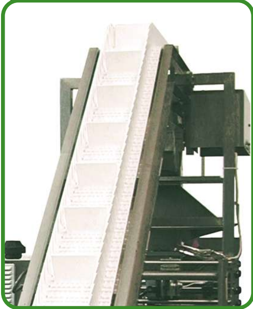
Loading conveyor belt with interchangeable pushers.

This wrapping procedure takes place automatically, with no drops, bruising or shocks, integrally preserving the original appearance and freshness of the most delicate products, in such a way as to optimise their preservation period and quality.