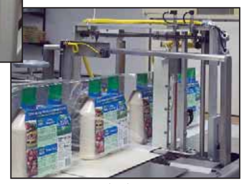
Vertical Sealing System