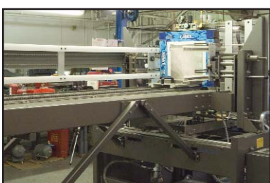
Optimal Extended Blank Feed