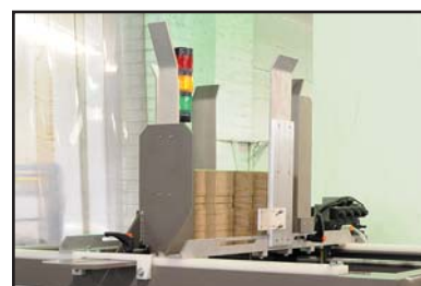
Blank Feed Hopper