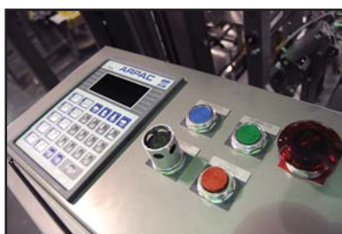
User-Friendly Operation Controls