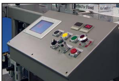
User-Friendly Operator Controls