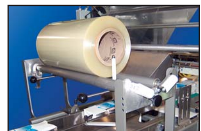
Film Cradle for Easy Film Loading