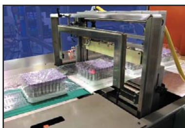
Interchangeable Horizontal / Vertical Cross Seal