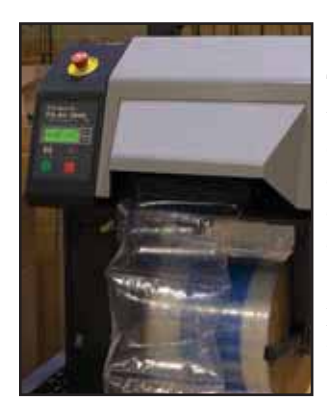
Create various cushion sizes with the Fill-Air® 2000 system.