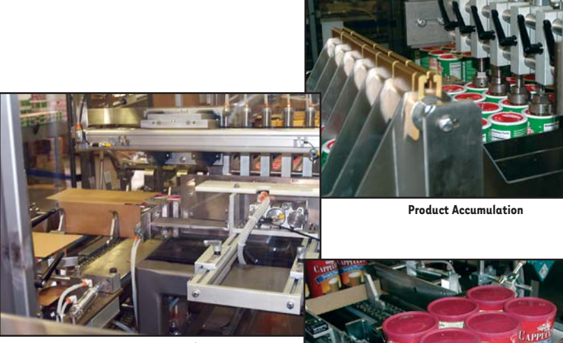
Tray or Case Loading