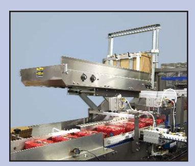
Easy Load Adjustable Blank Feed