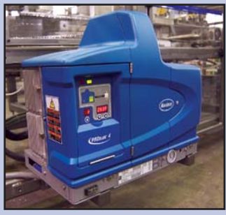
Standard Nordson ProBlue® Glue Unit