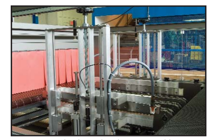
Optional Side Seal and Trim Assembly for a Totally Enclosed Package