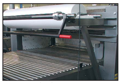
Optional Product Centering Device to Accurately Position Product