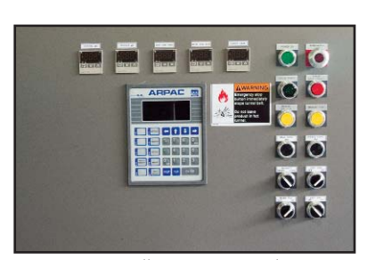
User-Friendly Operation Controls