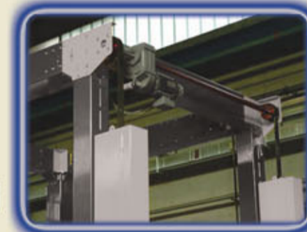
Counterweight system for smooth operation without vibration, resulting in a safer operation