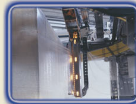
Infrared film tail seaming device ensures a full width seal

THE WULFTEC ENGINEERING TEAM HAS REDEFINED THE BOUNDARIES OF ROTARY RING WRAPPERS