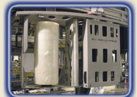
NO-THREAD® powered pre-stretch carriage with tilting film mandrel allowing fast and easy film loading