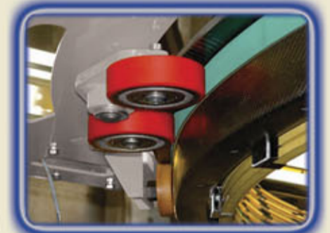
Horizontal and vertical ring guiding by self aligning and maintenance free polyurethane wheels