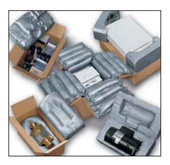
Instapak® Foam Packaging