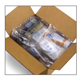
Fill-Air® Inflatable Packaging Systems