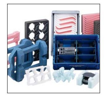
CelluPlank® Polyethylene Foam Stratocell® Laminated Foam