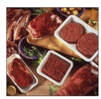
Cryovac® Food Packaging