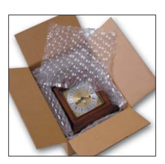
NewAir I.B.™ 200 Packaging System