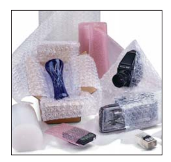
Bubble Wrap<sup>®</sup> & AirCap<sup>®</sup> Air Cellular Cushioning

Sealed Air's industry-leading investment in research and development and constant focus on World Class Manufacturing principles allow us to continue to deliver innovative packaging solutions that add measurable value to our customers' businesses around the world.