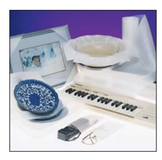
Cell-Aire® & Cell-Aire® Laminates Polyethylene Foams