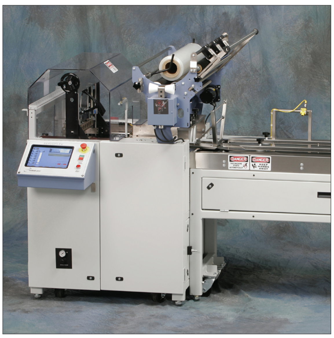
ServoFlex modular shown

Innovative Design Incorporates Servo Technology for the Ultimate Performance and Flexibility