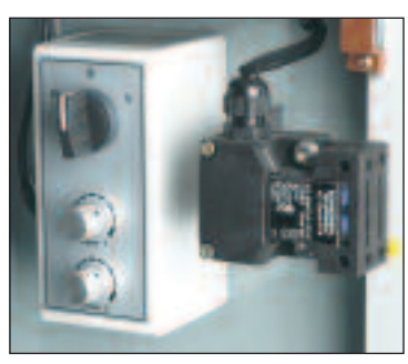
ADJUSTABLE PHOTO EYE FOR AUTOMATIC STRAPPING