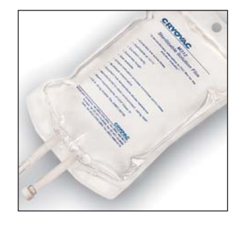
Cryovac® Medical Films