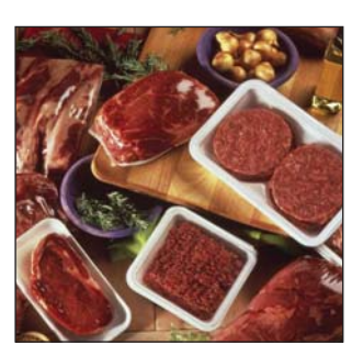
Cryovac <sup>®</sup> Food Packaging