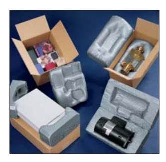
Instapak® Foam Packaging