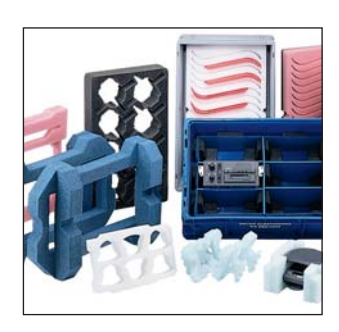
CelluPlank® Ployethylene Foam Stratocell® Laminated Foam