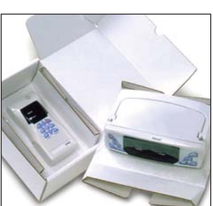
Flexible film membrane stretches around various shapes and sizes allowing one pack to work for a variety of items.