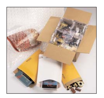
Bubble Wrap<sup>®</sup>, Jiffy<sup>®</sup> and Fill-Air<sup>™</sup> Materials, Mailers & Systems