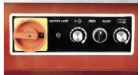
Compact Control Panel