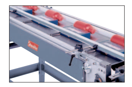
Adjustable Flight Bar Infeed

By selecting just the right combination of options you can customize your Hy-Speed wrapper for the ultimate performance, efficiency and value!