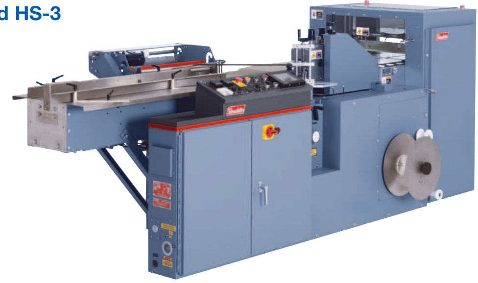
HS-1/HS-3 High Speed Automatic Wrapper

Shanklin was the first to offer the advantage of side-seal capability in a high-speed wrapper back in 1976... and today, that innovative design is the definitive industry standard for top-quality side-sealers! The HS-1 and HS-3 machines produce trim seals on three sides of a package with clear film on the remaining side, top and bottom... making it the perfect solution for products with top and bottom graphics. The HS-1 and HS-3 feature a simplified design for easy operation, maintenance, and changeover, and offer EZ film load capability.