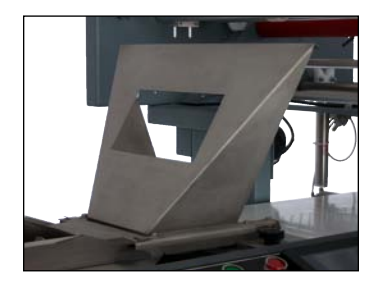
Quick Change Forming Head (HS-2 and HS-4 only)