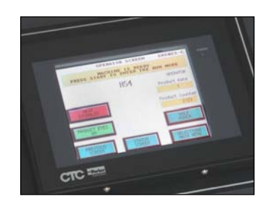
Full Color Touch Screen