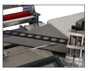
Adjustable Inverting Head (HS-1 and HS-3 only)