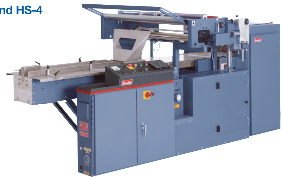
HS-2/HS-4 High Speed Automatic Wrapper

Ruggedly built Shanklin HS-2 and HS-4 wrappers are our overlap-sealing models that combine high speed and smooth product travel with quick and easy size change for the ultimate packaging performance! These machines produce packages with neat trim seals on both ends and a transparent overlap seam on the bottom. HS-2 and HS-4 feature convenient one-person film loading capability and are especially well suited for wrapping irregular-shaped product.