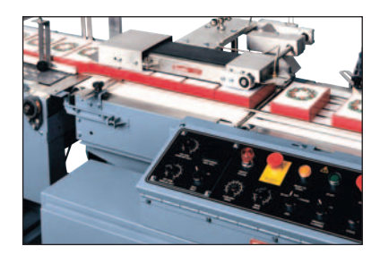
Harmonic Overhead Infeed