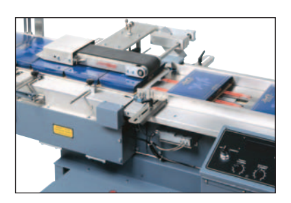
Synchronic Overhead Belt Infeed