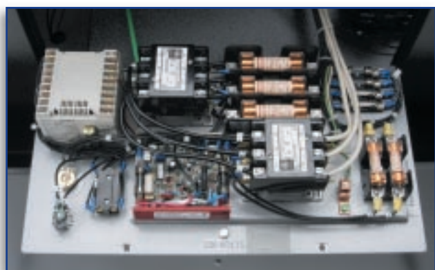
FOLD-DOWN CONTROL PANEL FOR EASE IN SERVICING