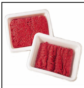
Cryovac® Case Ready Packaging Systems