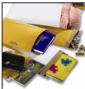
Jiffy Mailer® Products