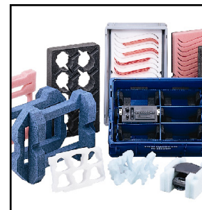
CelluPlank® Polyolefin Foam Stratocell® Laminated Foam