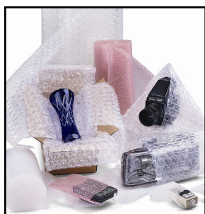
Bubble Wrap® & AirCap®

Sealed Air's industry-leading investment in research and development and constant focus on World Class Manufacturing principles allow us to continue to deliver innovative packaging solutions that add measurable value to our customers' businesses around the world.