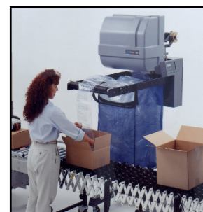
Fill Air™ Inflatable Packaging and Systems