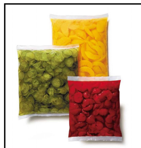
Cryovac® Flexible Pouch Systems