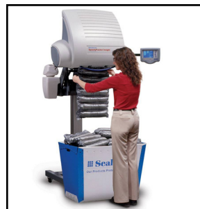
SpeedyPacker® Foam Packaging System