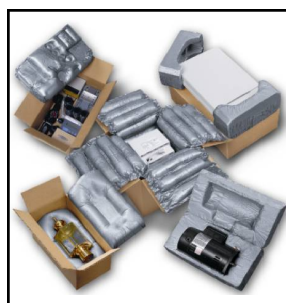
Instapak® Foam Packaging