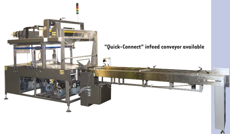
"Quick-Connect" infeed conveyor available

Utilizing polyethylene, polyolefin or PVC shrink film, the CAPRA® 8000LS produces aesthetically pleasing packages that are perfect for retail display. The CAPRA® 8000LS system offers extreme flexibility, and is designed to run large product sizes, as well as very small items. An optional product closing conveyor will handle small products up to 70 packages per minute. Other options include infeeds for coupon placement, stainless-steel construction for food environments and printed film registration.