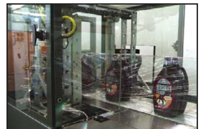
Vertical Sealing for Tall Product