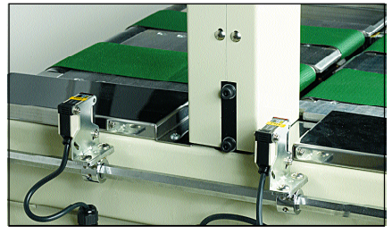
ADJUSTABLE PHOTO EYES FOR PRECISE STRAP PLACEMENT