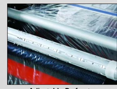
Adjustable Perforator with Brush Roller

For more details including line layouts, infeed systems, other machines and videos visit our website. Extreme Packaging Machinery, Inc: Phone: 949-888-7221 • 22831 Avenida Empresa • Rancho Santa Margarita, CA 92688