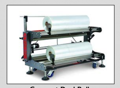
Compact Dual Roll Powered Centerfolder